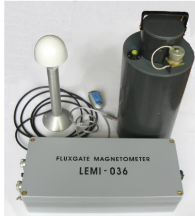
LEMI-036 Product picture

Fluxgate magnetometer (FGM) LEMI-036 was specially developed for the super-sensitive measurements of 3 components of Earth magnetic field induction and their variations in accordance with the new 1-second INTERMAGNET standard. The signals with periods from 1 to 100.000 seconds and more may be collected with a reasonable error. In order to realize this design, the major attention was paid to such principal FGM characteristics and parameters as frequency response and sampling synchronization accuracy as well as thermal and temporal stability and noise level.